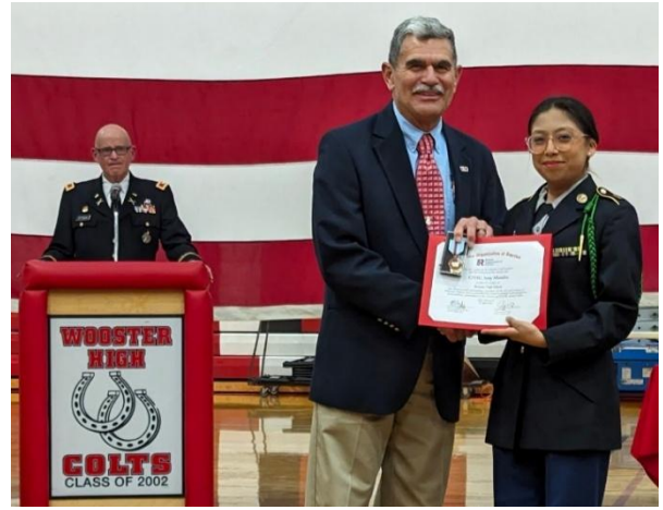
DoGW Wooster High School JROTC