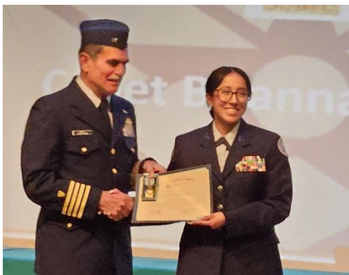
DoGW North Valley High School JROTC