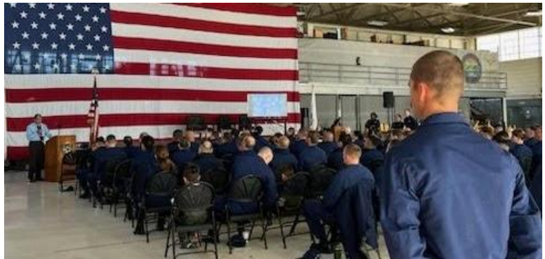
Ch 43 Presentation to USCG Reserve Sector San Diego