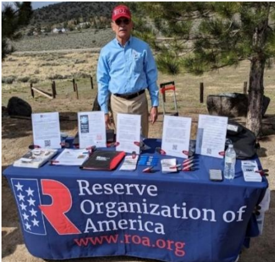
Northern Nevada Military Open House

Please share with us your activities photos, past and present.