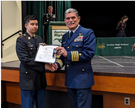
DoGW Incline High School JROTC