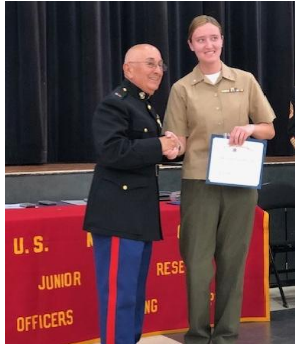
CH 63 Del Mar High School MJROTC