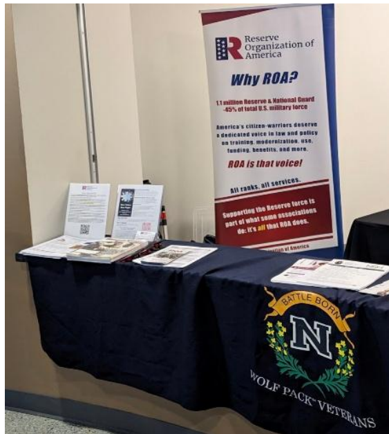
ROA booth at Nevada Univ Vet Assoc.