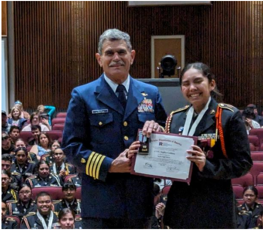
DoGW Sparks High School JROTC