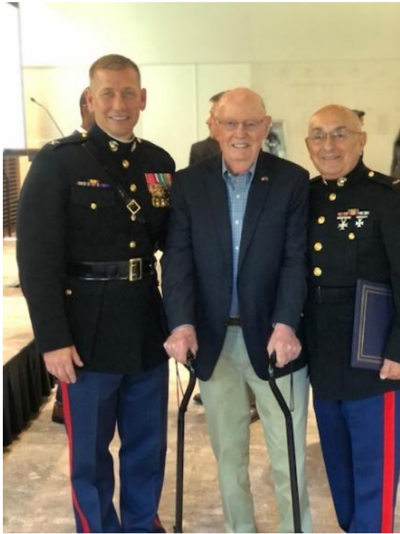
Ch 63 Hoover Institute at Stanford Univ Marine Corps Birthday Event