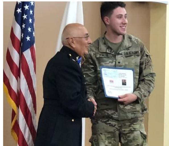
CH 63 Presentation to Santa Clara University ROTC