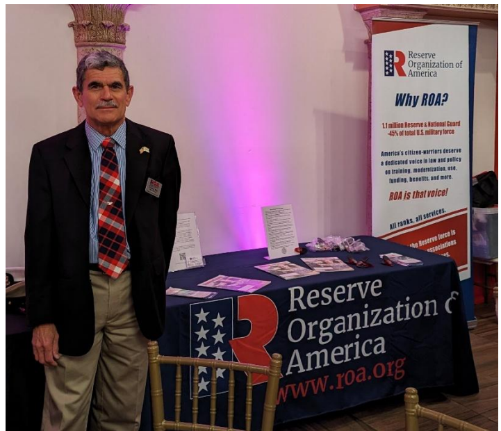
DoGW Booth Set-up. Tablecloth, pop-up, handouts, give away pens. **

**Our department has 4 sets of booth materials ready for your use.** Northern CA (Turlock); Southern CA (San Diego); Northern NV (Reno Area); Southern NV (Las Vegas)