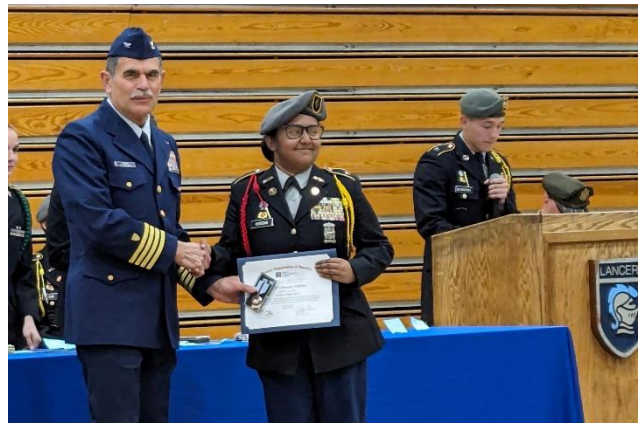
DoGW McQueen High School JROTC