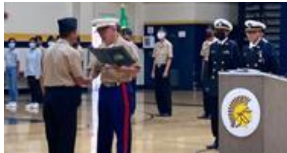
CH 63 Milpitas High School NJROTC