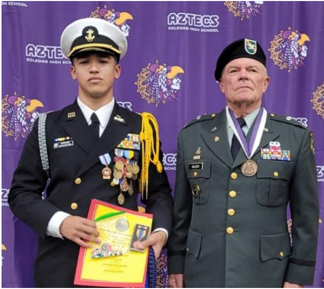
CH 32 Soledad High School JROTC