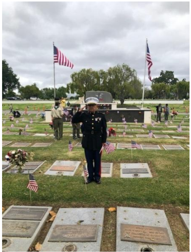
Ch 63 Oak Hill Cemetery Memorial Day