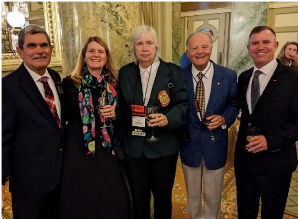
Formal Dinner in Washington DC at 100 th .