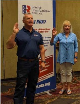
Swearing in our President and Naval VP at Las Vegas