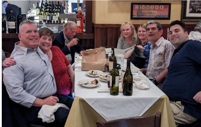
Dinner where a few attendees got together